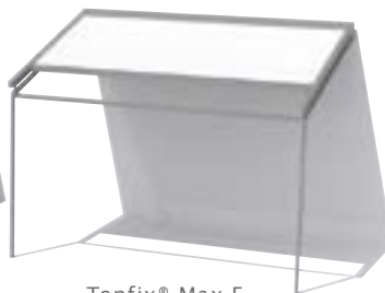
Topfix® Max F