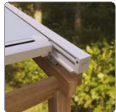
Mechanical safety for the bottom rail